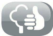
Environmental friendly (carbon neutral)