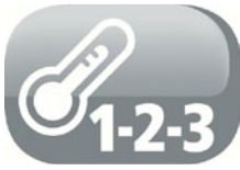
3 Heating settings