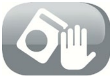
Tip over switch