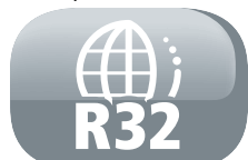
Environmental friendly refrigerant