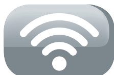
Wireless smart kit