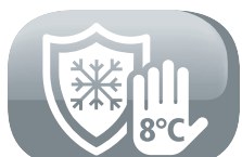
Home freezing prevention