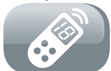
Remote control with LCD-display