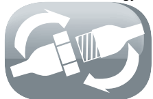
Quick Connector System