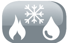
3 functions in 1